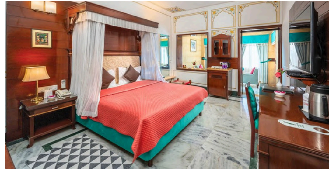
Mini Suite 461 SQ. FT.