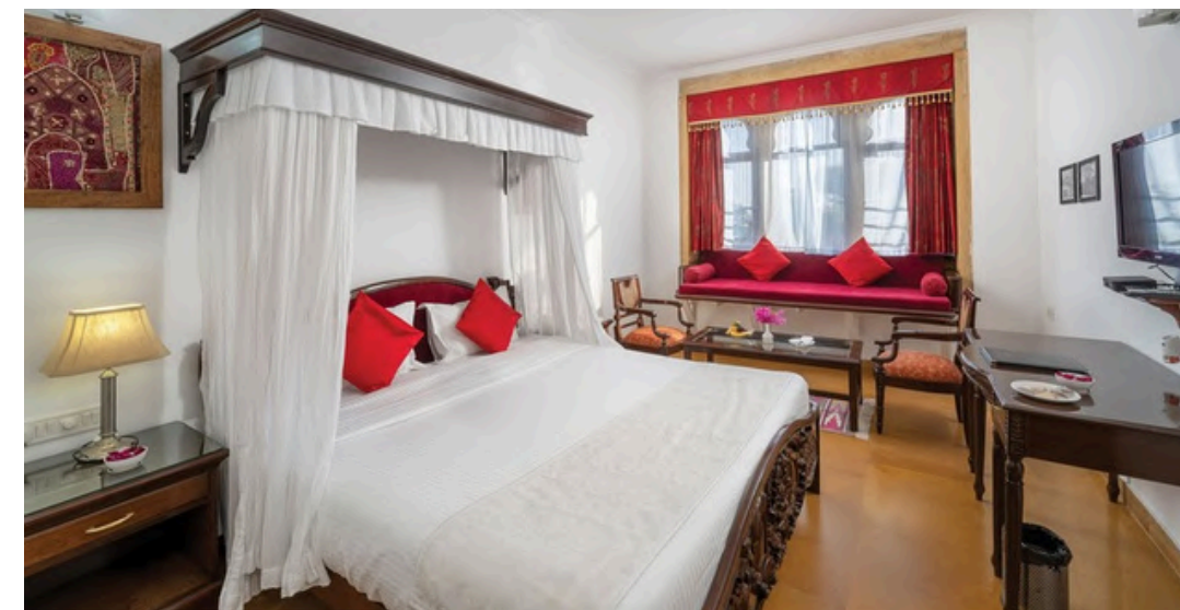
Deluxe 308 SQ. FT.