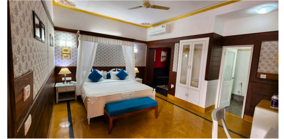
Heritage 340 SQ. FT.