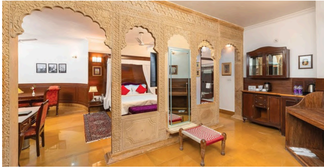
Royal Suite 898 SQ. FT.