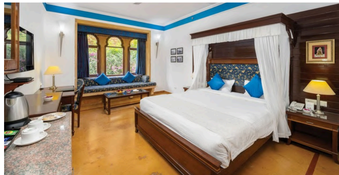
Super Deluxe 356 SQ. FT.